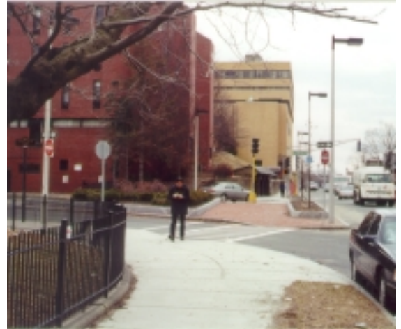
Warren Street Island at Cambridge Street.