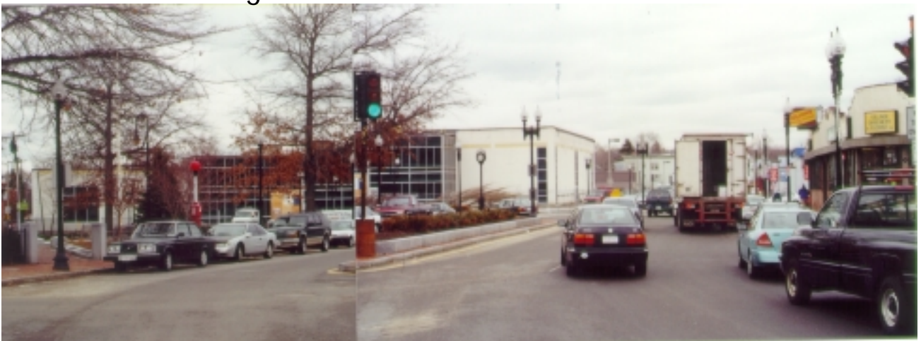
Oak Square and landscaped island at junction of Washington and Tremont Streets.