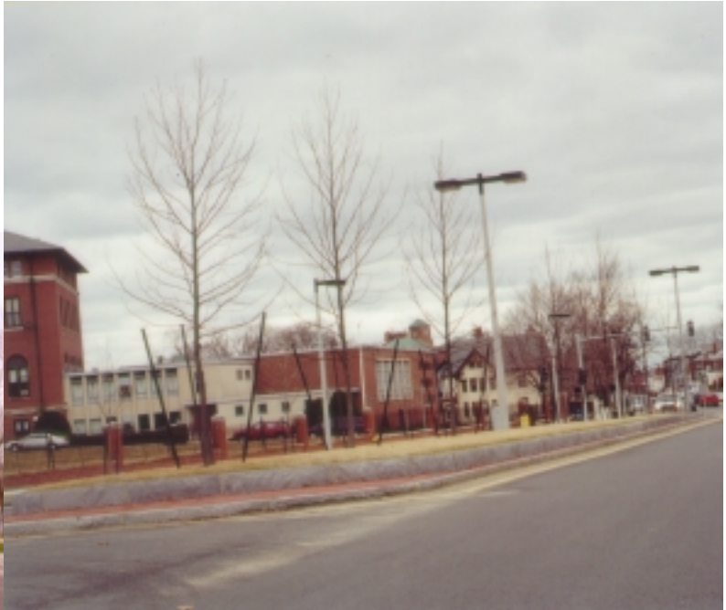
Street trees and landscaped island on Cambridge St. in Brighton.