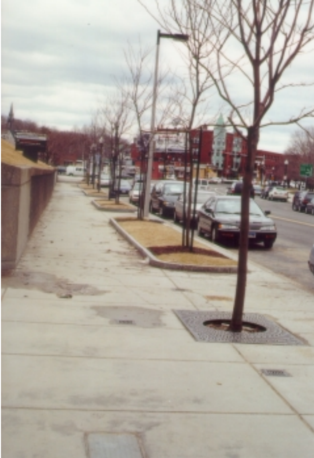
Cambridge Street street trees and tree grate.