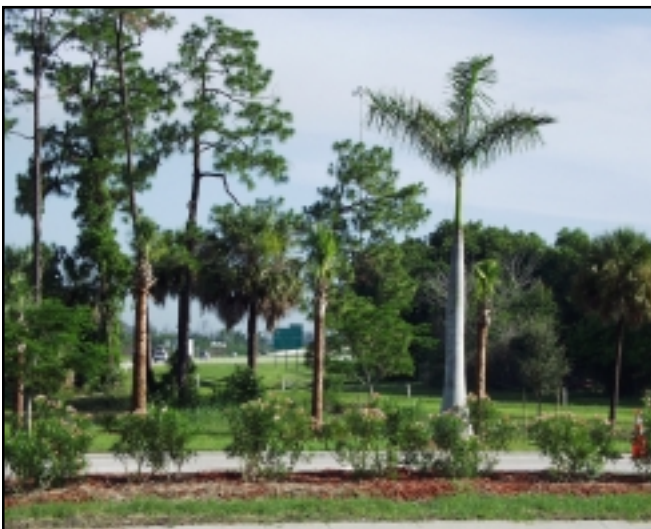
Landscaped pocket at the junction of I-75 and State Road

State Road 80 , (Palm Beach Blvd.) between the Ft. Myers city limits and Orange River Blvd., was designed in accordance with Florida D.O.T. standards. Palm trees line the side of the road to form a gateway at I-75. We also designed two landscaped and irrigated islands, and landscaped pockets at the junction of I-75 and State Road 80.