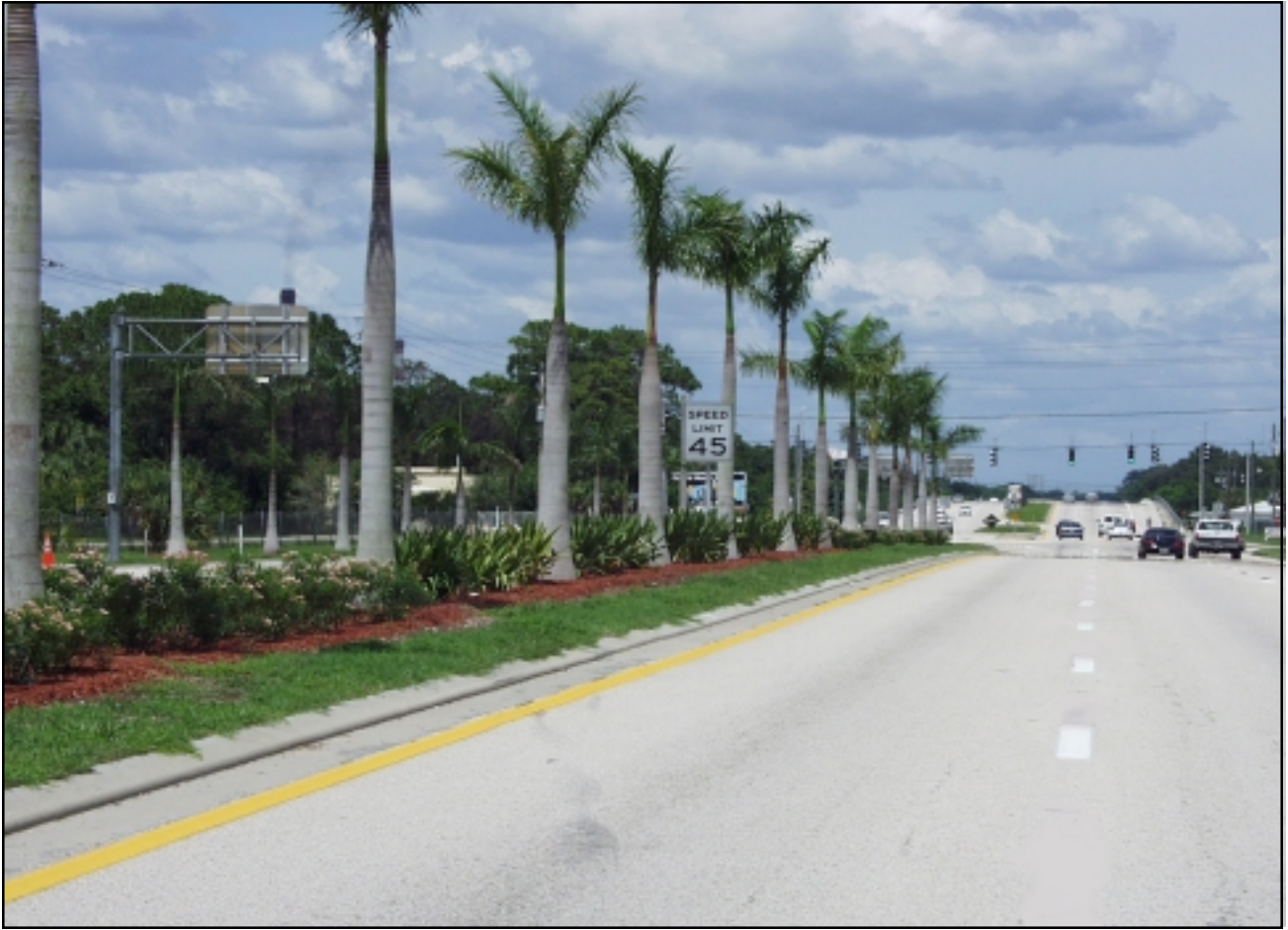
Landscaped island at the junction of I-75 and State Road 80.